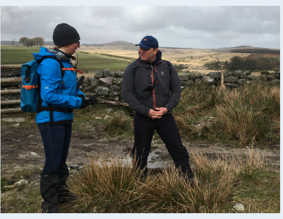
Walk and talk

'If you don't set goals you become part of somebody else's!'